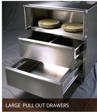
LARGE PULL OUT DRAWERS